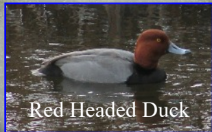
Red Headed Duck